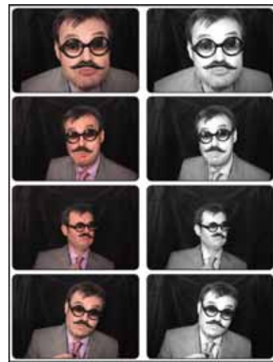
Colour + B&W strips

* Grids and strips only available with our Retro Booth.