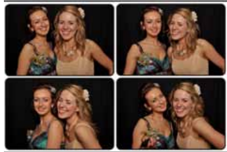
Grid of 4 Photos