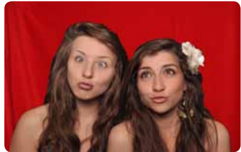
Classic Red Velvet