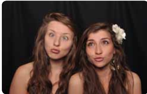
Classic Black Velvet